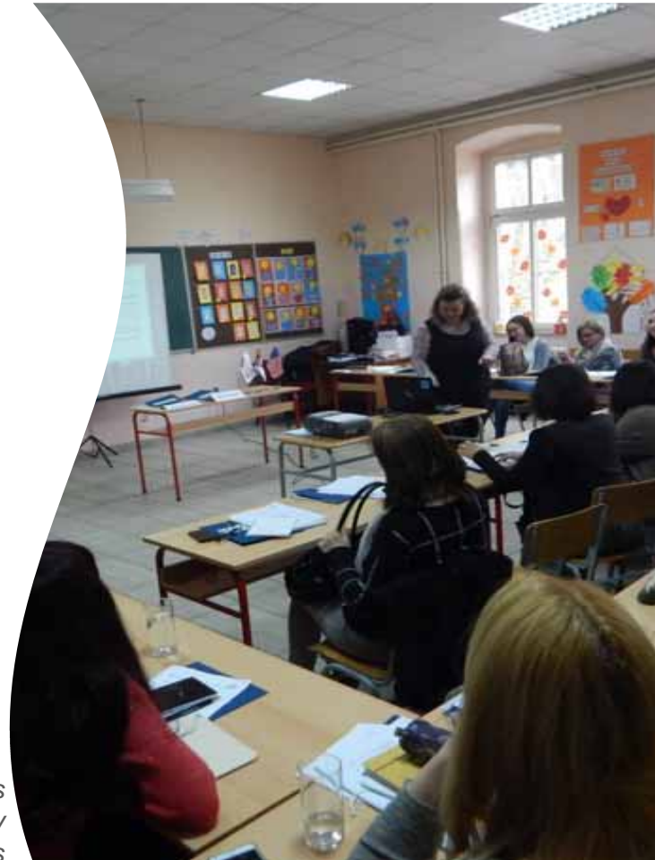
Presentation of modules to the elementary school teachers