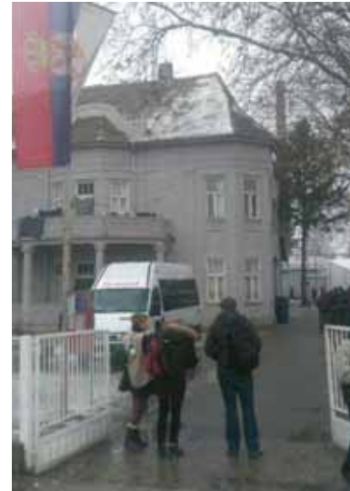
RRC Sid Current occupancy – 625 32% children