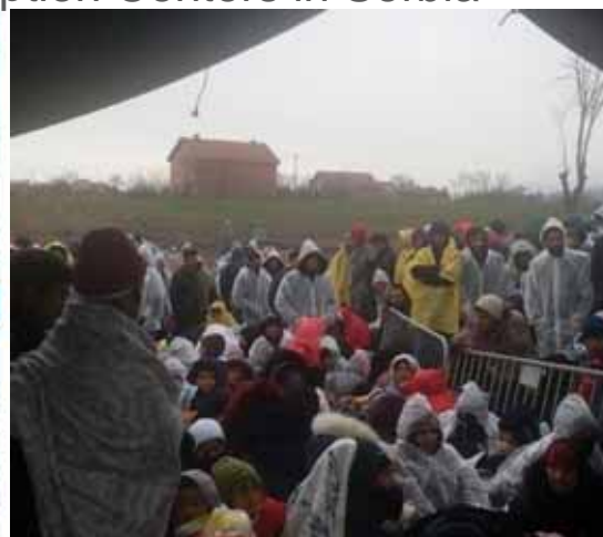
Border with FYROM