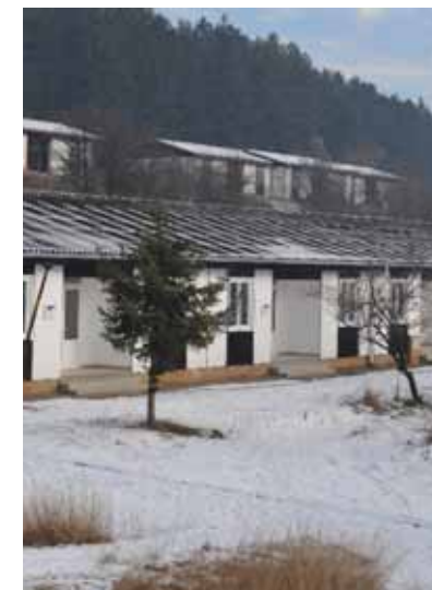
RRC Pirot Current occupancy - 255 47% children