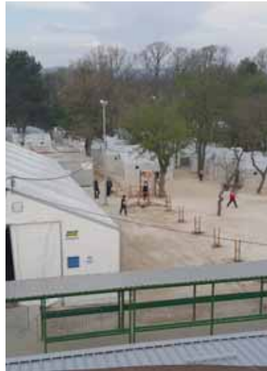
RRC Presevo Current occupancy – 868 49% children