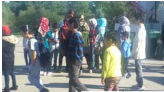
Children leaving the Center to go to school

Currently, approximately 100 refugee children between the age of 7 and 17 accommodated in the AC Krnjaca are regular attending 7 schools in the City of Belgrade. Additional schools, including schools outside of Belgrade, are in the process of enrolling refugee children.