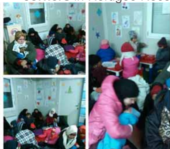
DRC/UNICEF Child Friendly Space in Miratovac