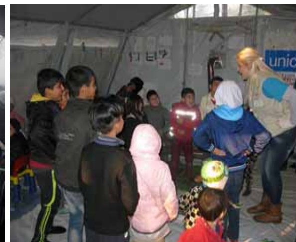
DRC/UNICEF Child Friendly Space in Presevo