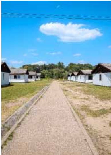
Krnjaca Asylum Center Current occupancy - 1090 49% children